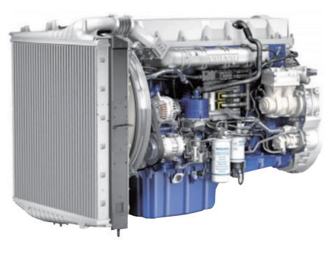
Fig. 11 Volvo D13K.

This engine features cooled EGR, a 2-stage turbocharger, and common rail system. In combination with a DPF and SCR, it complies with the Euro VI regulations <sup>(20)</sup>.