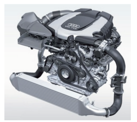
Fig. 7 Audi 3.0 BiTDI

This engine features multiple EGR (high-pressure hot EGR: recirculation from the exhaust manifold to the intercooler outlet, low-pressure cooled EGR: recirculation from the DPF outlet to the turbocharger inlet), a com-