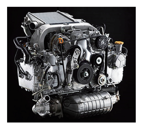
Fig. 5 Fuji Heavy Industries EE20.