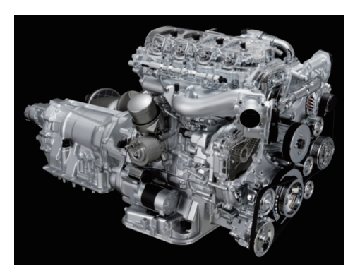
Fig. 3 Nissan YD25DDTi.

Installed on the Delica D:5, this engine features a vari-