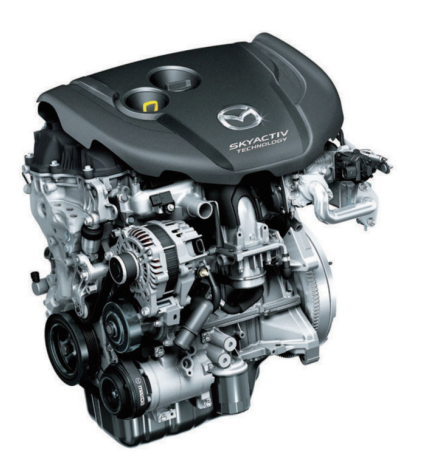
* Used by permission of Mazda Motor Corporation. All rights reserved. Reproduction prohibited.

DI: direct injection, TCI: turbocharger intercooler, L4: inline 4-cylinder