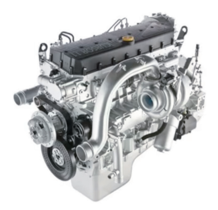
Fig. 9 IVECO Cursor 11.