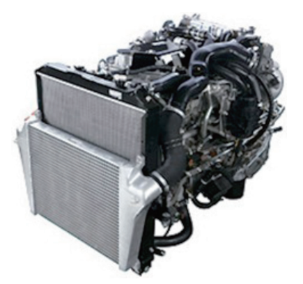
Fig. 4 Isuzu 4HK1.

Also available on the Forward and Erga Mio, the 6HK1 engine features cooled EGR, a variable geometry system (VGS) turbocharger, and common rail system. In combination with a DPF and SCR, it complies with the