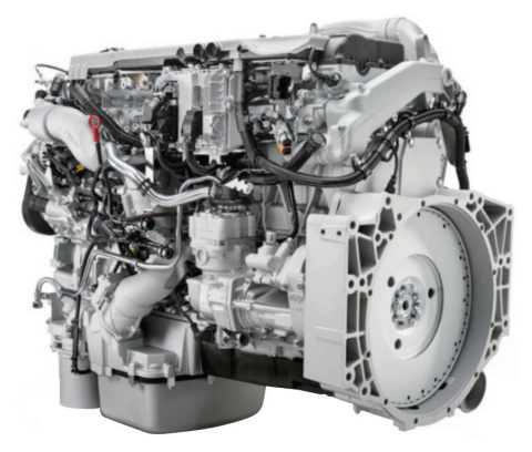
Fig. 10 MAN D0836.

and common rail system. In combination with a DPF and SCR with high NOx conversion efficiency even at low exhaust gas temperatures, it complies with the Euro VI regulations <sup>(16)</sup>.