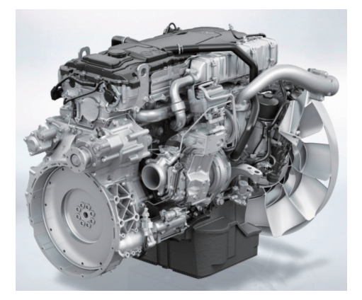
Fig. 8 Daimler OM 936.

mon rail system, and piezo injectors. In combination with a DPF, it complies with the Euro VI regulations <sup>(12)</sup>.