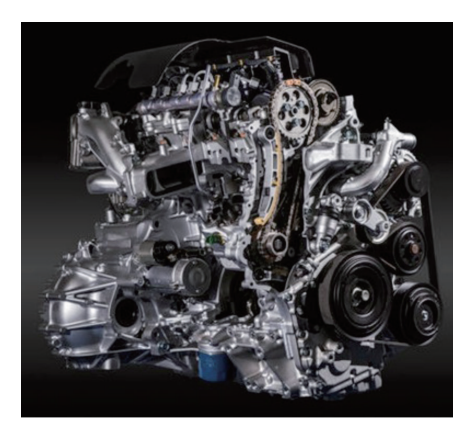
Fig. 6 Honda i-DTEC.

els for the European market. It is a horizontally opposed diesel engine with a VG turbocharger and common rail system. In combination with a closed DPF, it complies with the Euro V regulations <sup>(9)</sup>.