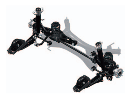
Fig. 1 Toyota Double Wishbone Rear Suspension (The figure shows the suspension of the Prius<sup>(4)</sup>)

pension and electronically controlled shock absorbers were adopted mainly in high-class sedans and SUVs.