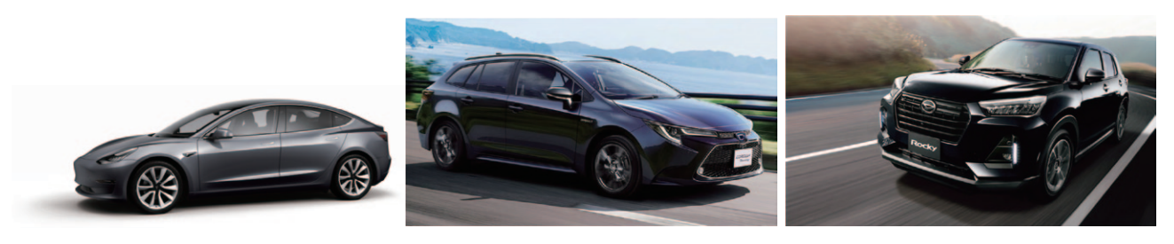
Fig. 4 Tesla Model 3