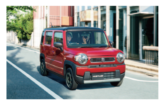
Fig. 10 Suzuki Hustler

In November 2019, ALL New the Mazda 3 line that had been fully redesigned in May was expanded with the addition of a model equipped with the SKYACTIV-X engine (Fig. 7). The core of the SKYACTIV-X technology is Spark Controlled Compression Ignition (SPCCI) combustion. Extensive research showing that burning a uniform lean premixed gas combust through auto-ignition would achieve low NOx, low PM, highly efficient combustion has been conducted in the past. However, it have never been commercialized before due to the difficulty of guaranteeing ignition and stable combustion under transient operation or in other fluctuating conditions, the need for balance with normal combustion imposed by the restricted operating range, and the complexity of the attendant mechanisms, control, and related systems. Achieving commercialization through advanced control and the technique of varying the pressure to induce auto-ignition in spark ignition therefore deserves a high de-