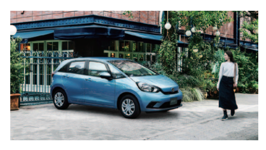
Fig. 11 Honda Fit (Basic model in picture)