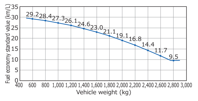
Fig. 3 FY 2030 Fuel Economy Standard Values by Vehicle Weight

The passenger car fuel economy standards for standard emissions defined in June 2019, which directly affect CO<sub>2</sub> emissions and represent the next stage of Japanese standards, have been announced<sup>(4)</sup>. They contain three key points. The first is the introduction of the well-towheel (WTW) concept, which traces energy consumption back to the electricity generation stage. The calculation of power generation efficiency is based on the power source mix of the Long-Term Energy Supply and Demand Outlook (Ministry of Economy, Trade and Industry, July 2015), which takes into account the WTW viewpoints expressed in the power supply industry thermal power generation criteria outlined in the business operator criteria concerning the rationalization of energy use in plants or other facilities stipulated in the Act on the Rationalization etc. of Energy Use, as well as in the interim report of the Strategy Meeting for the New Era of Automobiles (July 24, 2018). The second is the switch from the JC08 test cycle to the WLTC for evaluation tests. The third is the establishment of fuel economy standard values based on vehicle weight. Although having standard values differ by vehicle weight is a continuation of past practice, implementing it in the context of