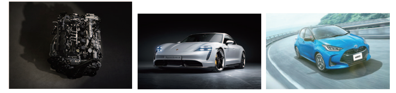
Fig. 7 Mazda SKYACTIV-X Engine