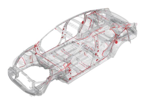
Fig. 1 Structural adhesive locations in the Accord

The first-generation N-Box uses tailor welded blanks in the outer panel. They consisted of 270 MPa 0.65 t and 590 MPa 1.6 t blanks that were welded, and then molded integrally in a molding die. This overcomes the technical issues of achieving partial changes in thickness and high strength in outer panels, which are the largest parts of the vehicle body and must present a high quality external appearance. Shifting the strength burden to the outer panel made it possible to eliminate the conventional stiffener. This not only reduced waste, but also increased space efficiency by allowing the seat belt mechanism to be stored inside the pillar cross-section. The second-generation N-Box goes even further. The blanks were