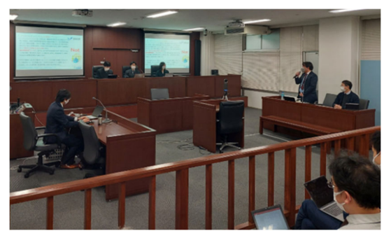
Figure 2. Mock trial in the courtroom at Meiji University

The aim of this mock civil trial (Figure 2) was to examine, using a hypothetical crash scenario caused by a car with the Level 2 automated driving system, if the legal liability of the manufacturer for inappropriate or inadequate system design and that of the dealer for inappropriate or insufficient explanation about the system would be recognized when the limitations of human capabilities for safe use of the system were publicly known.